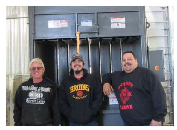
Sanitation purchased 20 cardboard dumpsters spring of 2018 and a baler.

Rice Lake – Monday 8am-4:30pm Naytahwaush – Tuesday 8am-4:30pm Elbow Lake – Wednesday 8am-4:30pm White Earth – Thursday 8am-4:30pm Pine Point – Friday 9am-4:30pm