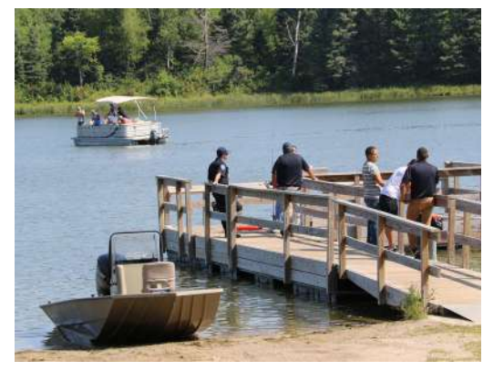
The annual Take an Elder Fishing was held Aug. 9 at Little Elbow Lake Park. Several elders attended and were able to fish, catch some sun, and take home prepared fish.