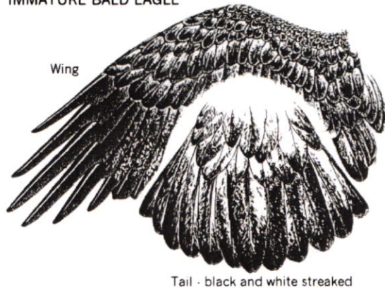
IMMATURE BALD EAGLE