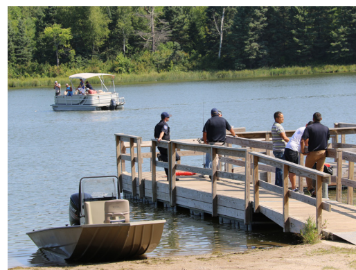
The annual Take an Elder Fishing was held Aug. 9 at Little Elbow Lake Park. Several elders attended and were able to fish, catch some sun, and take home prepared fish.