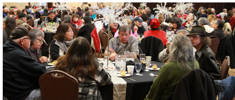
Around 400 elders, spouses, and caregivers attended the 2017 Annual Christmas Celebration held Dec. 7 at Shooting Star Casino.