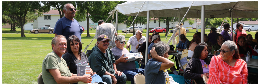
Over 350 elders attended the White Earth Elders annual Summer Picnic on July 27 at Waubun City Park. Elders could visit resource booths, enjoy a picnic-style lunch, play bingo, and win door prizes. Several White Earth programs helped prepare and serve the food, along with several area youth.