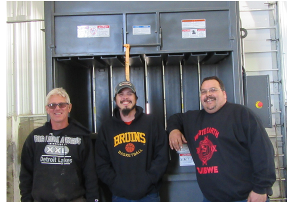
Sanitation purchased 20 cardboard dumpsters spring of 2018 and a baler.